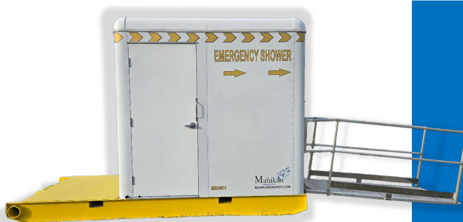
Set Up without optional Generator Package